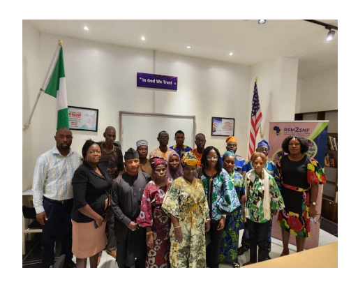
Fig 1: In-person participants in Ibadan